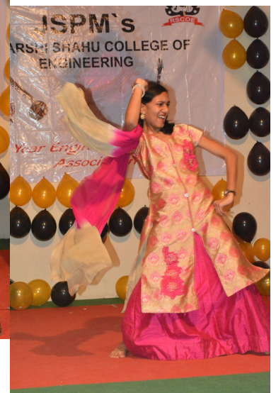
Solo Performance at FESA.

FESA stands for First year Engineering Students Association. FESA is a platform for the FE students.