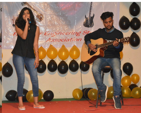
Singing and Guitar