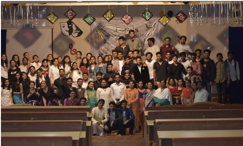
Active Members of FESA and Faculties