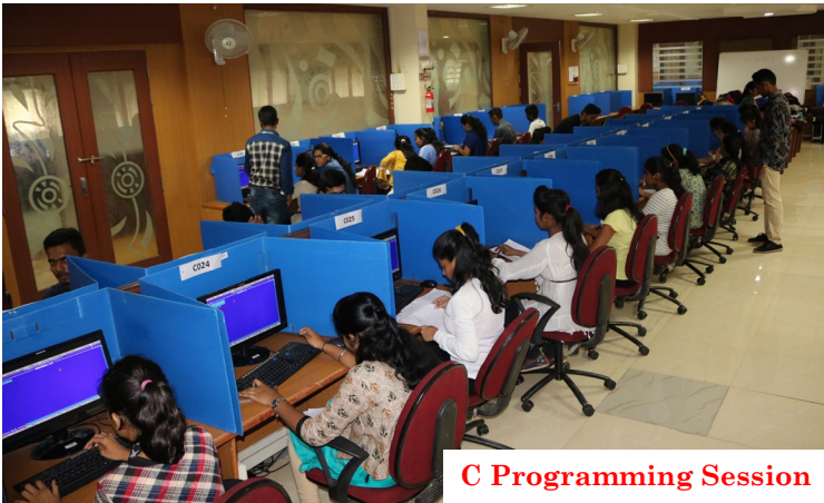
C Programming Session

The Induction Program was arranged for all FE admitted students according to their branches with count of 120 students per batch. The program was designed so as to make the students familiarize with the new environment and various activities taking place in college. Also to make them aware about importance of skills required to face the global challenges.