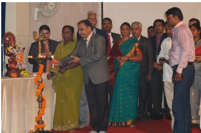
Inauguration of Induction Program on 25th July 2018

As per the guidelines given by AICTE, One week Induction program was arranged for the students. On 25th, 26th & 27th July 2018, Principal addressed the parents of admitted students.