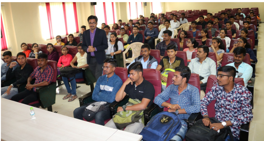
Training and Placement Session on 26th July 2018

The Induction Program was conducted in Six different Sessions Such as: