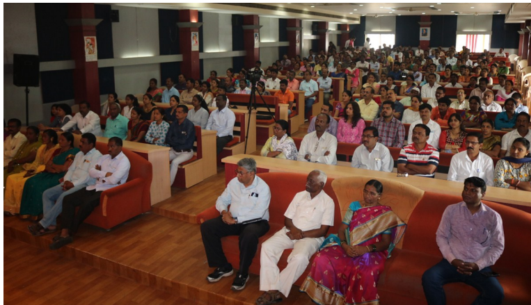
Parents of admitted students at Induction Program